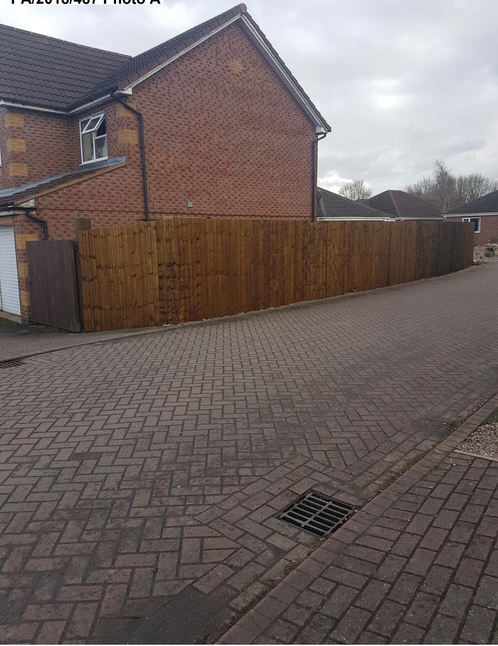
PA/2018/487 Photo A